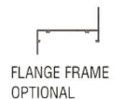
FLANGE FRAME OPTIONAL