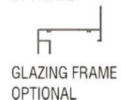
GLAZING FRAME OPTIONAL